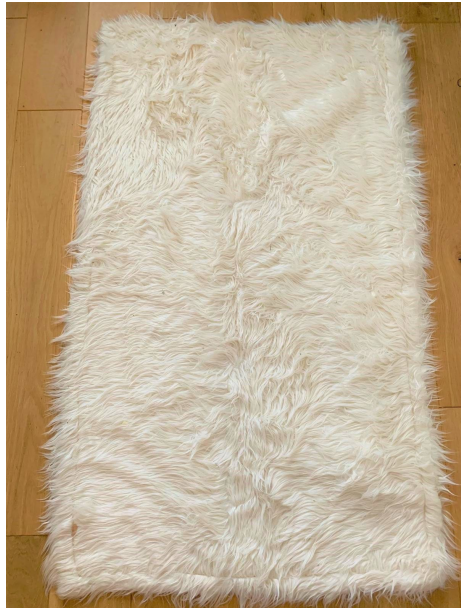
Large white rug (90 cm x 150 cm) [Left]