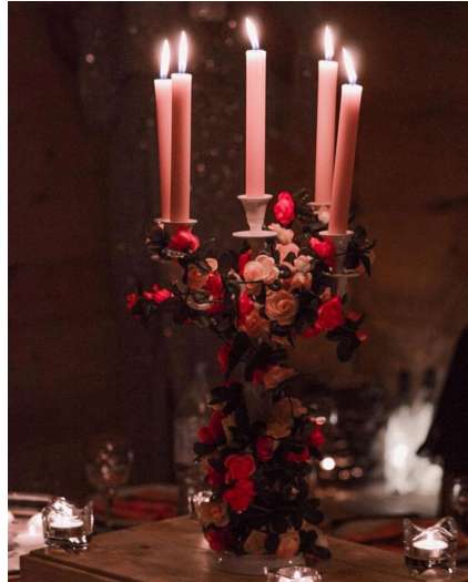
Candelabra (available in pink and white)