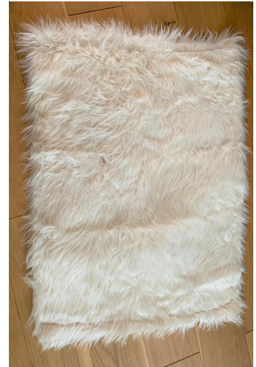
Small white rug (70 cm x 90 cm) [Right]