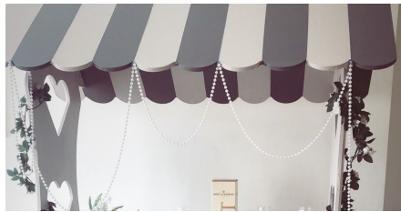
Classy Pearl Beads

We have a selection of garlands that can decorate the cart for any of our hire options, please contact us for availability and prices.