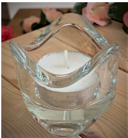
Long and short tea light holders