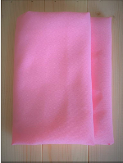
Pink Linen napkins