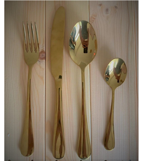
Gold Cutlery Sets

A selection of cushions great for alternative seating or themed furnishings.