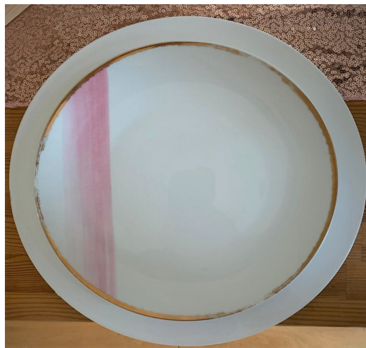
Large White Charger (not crockery)

Please note pictures are for demonstration purposes only and may vary from packages listed, clients will be presented with what is listed in the chosen package. Stock is subject to change.