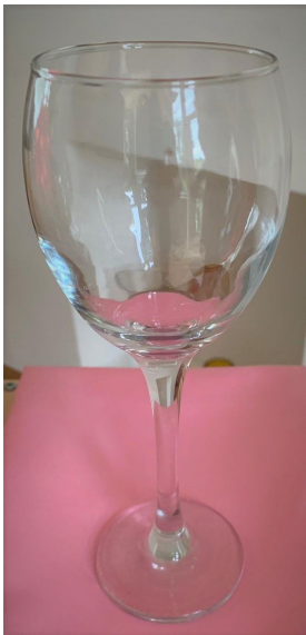
One size wine glass