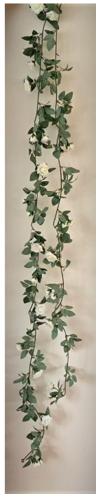
Classic White Ivory