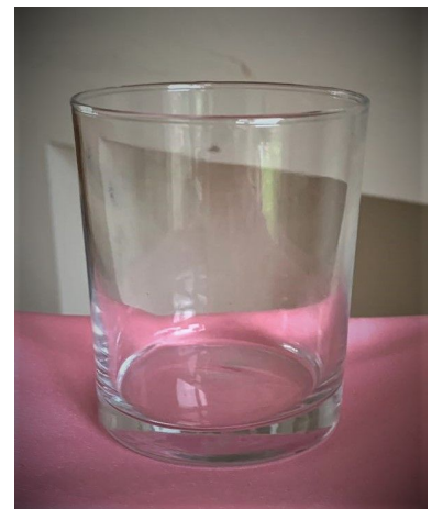
Small ball glass

Please note pictures are for demonstration purposes only and may vary from packages listed, clients will be presented with what is listed in the chosen package. Stock is subject to change.